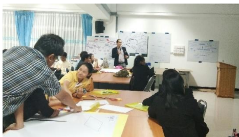
Figure 3. Facilitator asking the higher-order thinking questions during STEM workshop

The integrated STEM workshop lasting for 2 days (organized during 17-18 February 2018) was designed with a focus on encouraging rural in-service science teachers to solve an ill-defined problem utilizing the engineering design process to design, build, and test their creations of a chain reaction in marble run (see Figure 2). In the challenge situation, teachers would be asked to consider the constraints of the materials and time, identify the problem, think about what they already know, design, plan, construct, test and evaluate a physical prototype of their track design. Teachers were encouraged to construct a convincing argument for a particular solution as opposed to all other possible solutions and start out by drawing plan of their prototype with dimensions and details on a